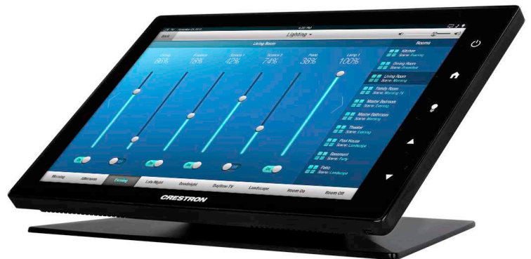
TSW-1050-B-S with TSW-1050-TTK TableTop Mounting Kit