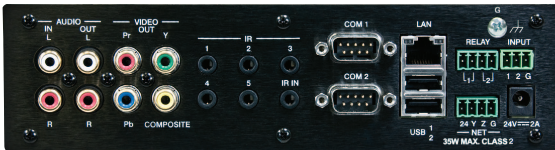
MC3 – Rear View

to iPhone®, iPad®, and Android™ devices, letting you safely monitor and control your entire residence or commercial facility using the one device that goes with you everywhere. Even Samsung Smart TV® has a Crestron control app available.