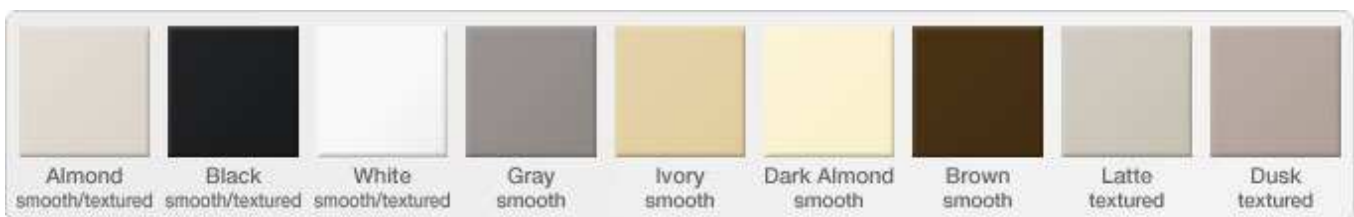
Cameo keypad colors and finishes (actual colors may vary)

Crestron infiNET wireless technology affords reliable 2-way communications throughout a residential or commercial structure without the need for physical control wiring. Employing a 2.4 GHz mesh network topology, each Cameo Wireless Keypad functions as an expander, passing command signals through to every other infiNET device within range (approximately 150 feet or 46 meters indoors), ensuring that every command reaches its intended destination without disruption.