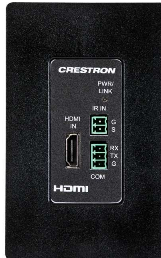
Wallplate not included

The HD-TX3-C handles uncompressed Full HD 1080p, Ultra HD, 2K, and 4K video signals with support for 3D, Deep Color, and HDCP. Audio capabilities include support for high-bitrate 7.1 audio formats like Dolby® TrueHD and DTS-HD Master Audio™ as well as uncompressed linear PCM. All signals are transported over a single CAT type cable, supporting 1080p, WUXGA, and 2K signals at distances up to 330 feet (100 m) using Crestron DM® Ultra or DM 8G® Cable, or third-party CAT5e. Higher resolutions up to UHD and 4K are supported at distances up to 330 feet (100 m) using DM Ultra Cable, 230 feet (70 m) using DM 8G Cable, or 165 feet (50 m) using CAT5e. [1]