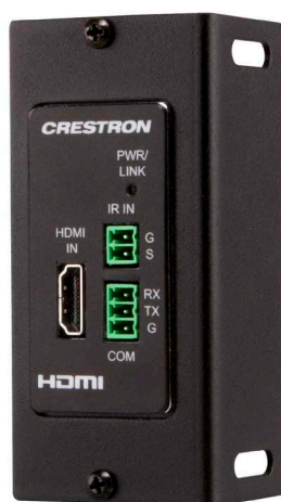
HD-TX3-C-B – With Mounting Bracket