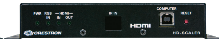
HD-SCALER – Right Side View