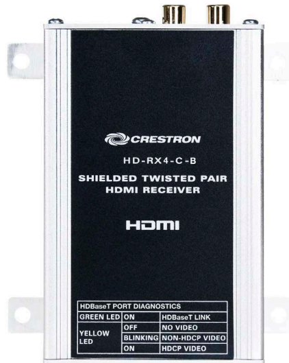
HD-RX4-C-B – Top, Front & Rear View