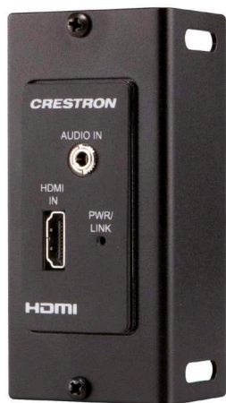
HD-TX4-C-B w/Surface Mount Bracket