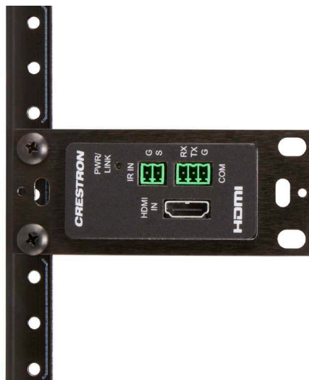
HD-TX3-C-B & HD-RX3-C-B Attached to Rack Rails