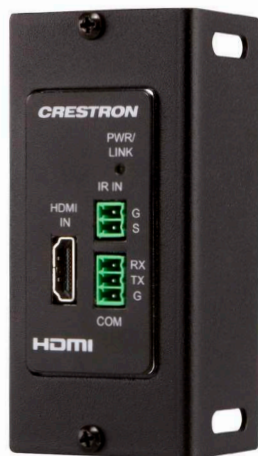
HD-TX3-C-B w/Surface Mount Bracket