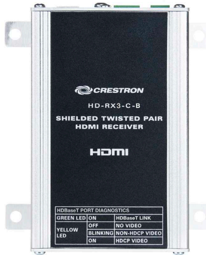
HD-RX3-C-B – Top, Front & Rear View