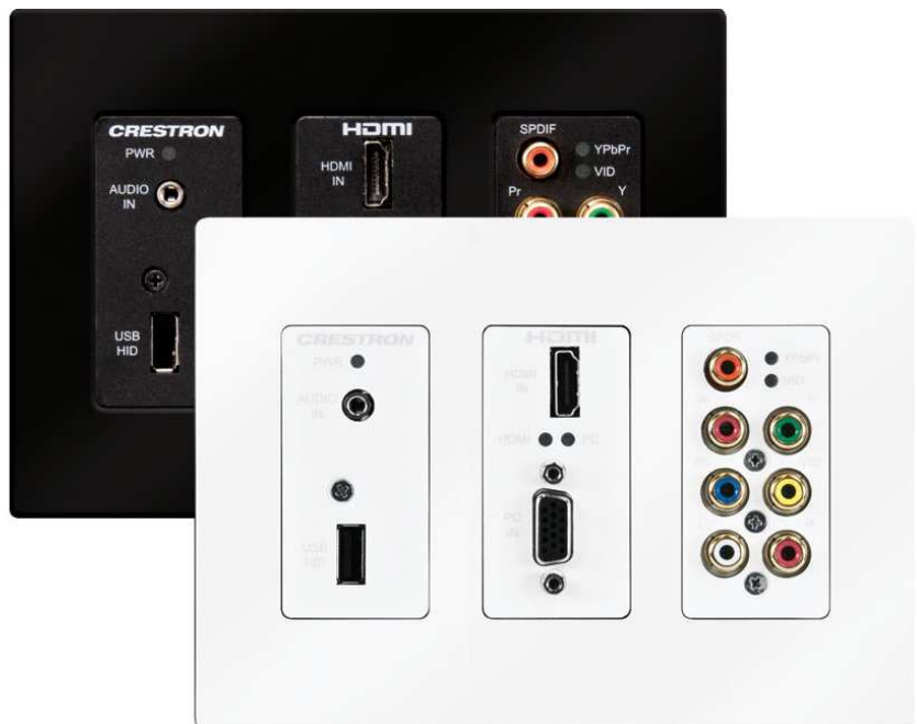
Faceplates not included.

The DM-TX-400-3G provides versatile switching among four inputs. The inputs can be configured to switch automatically or be selected through a Crestron control system.