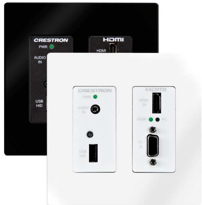
Faceplates not included.

1920x1200 pixels, as well as analog video up to 1080p60 [4] . A 1/8" (3.5mm) stereo audio input is included to accommodate analog audio signals from an unbalanced line-level source or headphone output.