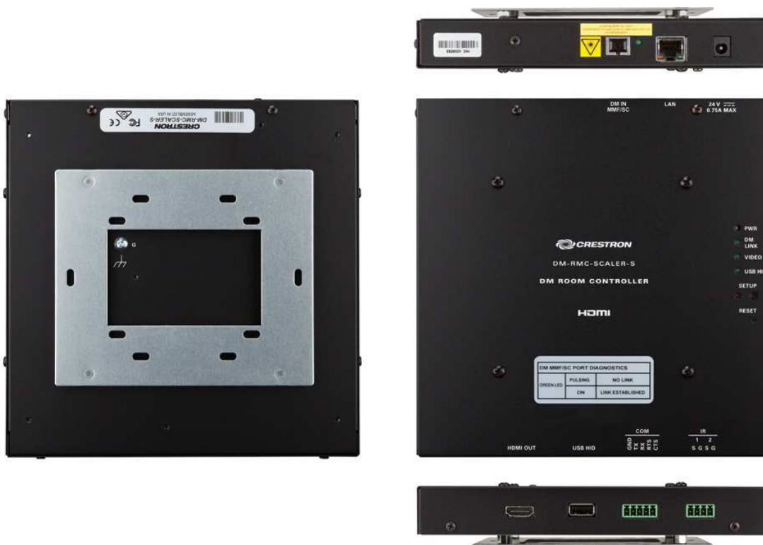
DM-RMC-SCALER-S – Rear, Top, Front, and Bottom Views