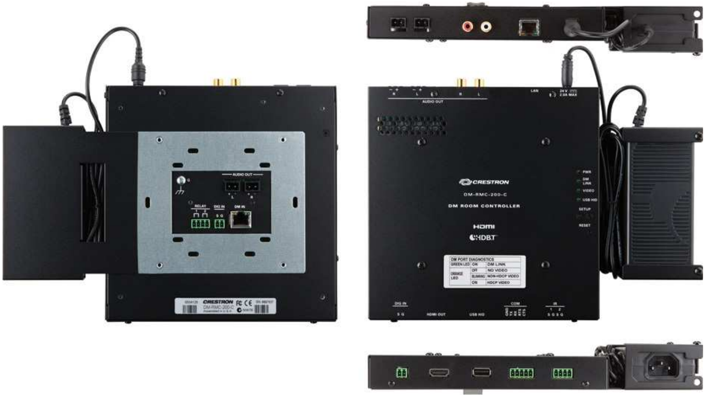
DM-RMC-200-C – Rear, Top, Front, and Bottom Views

and networking signals all through one simple RJ45 connection. [1] Multiple DM-RMC-200-Cs may be installed to handle each display in a multiroom distribution system, all fed from a central DM-MD series switcher. Or, a single DM-RMC-200-C can be fed straight from a DM 8G+ or HDBaseT transmitter, affording a simple solution for extending a computer or AV signal to a single display.