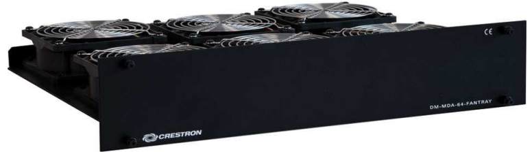
Model DM-MDA-64-FANTRAY shown

A DM-MDA-FANTRAY provides a backup replacement cooling fan tray assembly for a Crestron® DM-MD64X64 or DM-MD128X128 DigitalMedia™ Switcher. The DM-MDA-64-FANTRAY is the fan tray for the DM-MD64X64; the DM-MDA-128-FANTRAY is the fan tray for the DM-MD128X128. The DM-MD64X64 and DM-MD128X128 each ship with one fan tray included. On either switcher, the complete fan tray assembly can be swapped in seconds on-site without requiring any tools, and without shutting down or removing the switcher from the equipment rack.