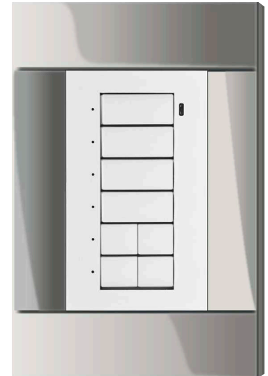
Black and white shown (Vimar cover plates not included)

Specially designed for use with Vimar™ brand mounting boxes, frames, and cover plates, the Cameo® C2N-CBV-P keypad offers a custom control solution for yachts and other installations.