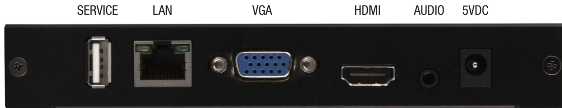
AM-100 – Rear View