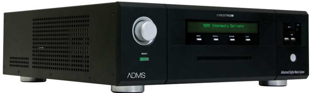
ADMS-BR model shown

Giving you the power to acquire and manage virtually any content you desire is what Intermedia Delivery is all about. The ADMS provides a streamlined solution for storing and playing all your digital videos, music, photos and home movies. It also delivers a seamless online experience, letting you rent major motion pictures from Netflix®, stream videos from YouTube® and Vimeo®, and watch your favorite news, sports, and TV shows through Hulu® and Hulu Plus [1] , Metacafe®, Comedy Central®, ESPN®, CNN®, and numerous other top providers. Built-in Web browsing completes the experience, giving you full access to all that the Internet has to offer without leaving the comfort of your home theater or living room sofa.