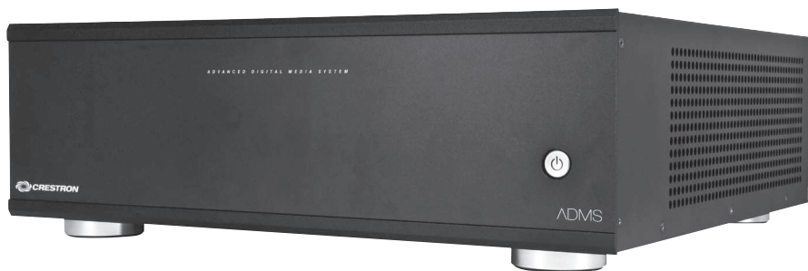
ADMS (faceless) – Front View

Of course, the ADMS affords seamless integration with your Crestron control system, unleashing a wide assortment of control options using Crestron handheld remotes and touch screens , or even mobile devices like the iPhone® , iPad® , or Android™ . Its onscreen keyboard allows simple one-handed navigation using any Crestron remote. A wireless touch screen affords the ultimate in control, reproducing the ADMS onscreen experience within a beautiful color touch screen complete with cover art and metadata. Adding touch screens throughout the house enables full access to your entire media collection from any room. Even video can be distributed to HD displays in any room using a Crestron DigitalMedia™ system. [3,4]