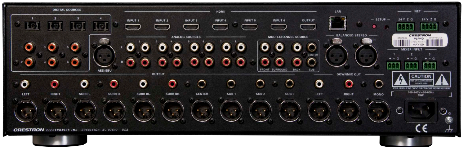
PSPHD – Rear View

To accommodate inputs from your microphone mixer and teleconferencing codec, the PSPHD includes a built-in 3-channel line mixer. Independent mono and stereo “downmix” outputs are also provided to feed the mix-minus signal back to the codec, and to send your own mix of signals to recorders and assistive listening equipment. Each mixer input features independent control over the signal level going to each of the individual main, surround, rear, and downmix outputs giving you complete control over which signals are heard from each speaker in the room.