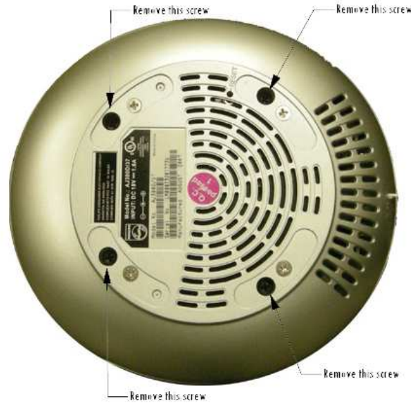
Bottom of Philips AJ300D/37 Clock Radio

1) Remove the rubber feet that are adhered to the bottom of the AJ300 Clock Radio to expose the screw holes.