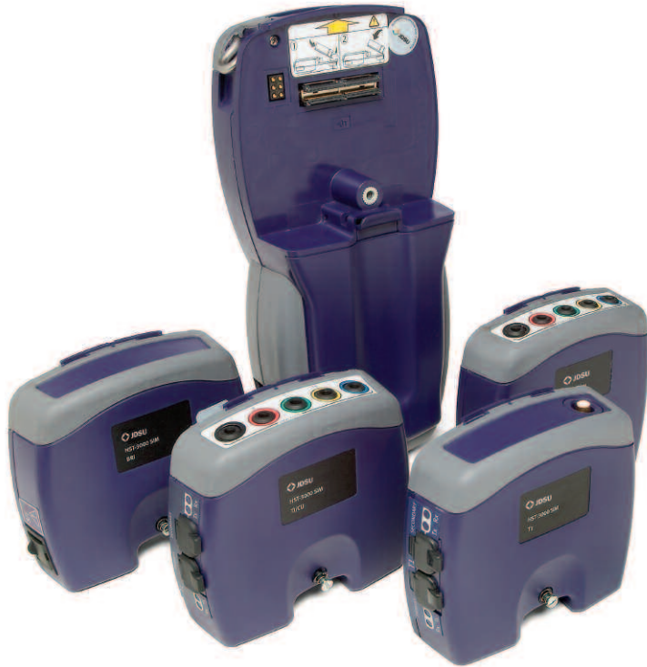
Figure 2. The architecture of the HST-3000 enables fast, easy field-swapping of a wide variety of test modules.

To accommodate the future and changing needs of wireless field technicians, the HST-3000 is an easily upgradeable platform that will allow for the support of new technologies and advanced options.