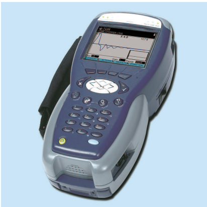
HST-3000 Handheld Services Tester Actual size: 9.5 x 4.5 x 2.75 in Weight: 2.7 lb with battery

Flexible, modular platform simplifies technology upgrades or hardware changes