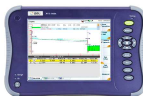
Compact multilayer platform for network installation and maintenance