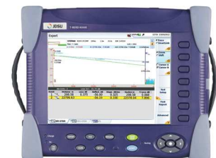
Scalable platform for multiple-layer and multiple-protocol testing