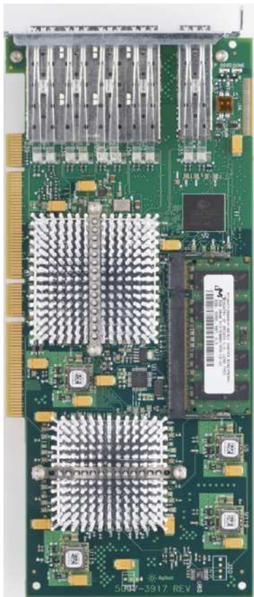
Figure 1. J6870A 10/100/1000 Mbps Blade Interface

Time-synchronize the Blade Interface to an external NTP server. Accuracy \pm 20 msec. Communication is done through the separate GPIO Ethernet port.