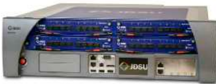
Figure 3: External trigger for connecting the Xgig Analyzer