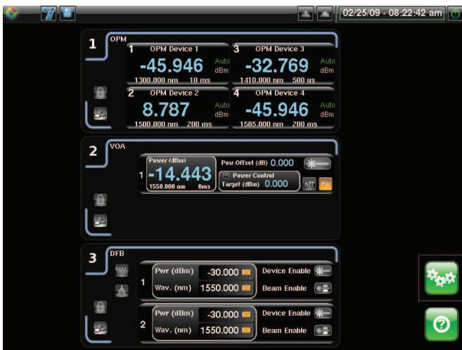
Figure 1. mOPM main user interface