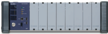
MAP-230B (top) and MAP-280 (bottom) mainframes