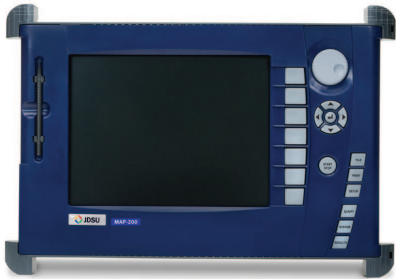
Figure 1. Keypad/display module