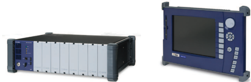
Figure 2b. Configuring the MAP-200KD next to the MAP-280 is optimal for applications where users require access to the device under test, the MAP-200 modules, and the GUI.