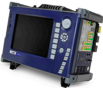
Figure 2a . Mounting the MAP-200KD on the MAP-230 is the optimal configuration for applications where users frequently require GUI access.

As Figure 2a shows, the MAP-230 mainframe can be used with the MAP-200KD module mounted on top of it. The pop-out feet on the mainframe let users position it in a front-facing manner for optimal viewing and interaction.