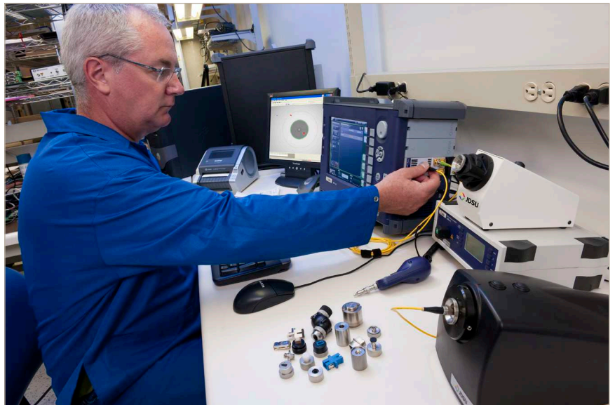
A typical connector test bench would include the JDSU solutions for IL and RL plus connector inspection