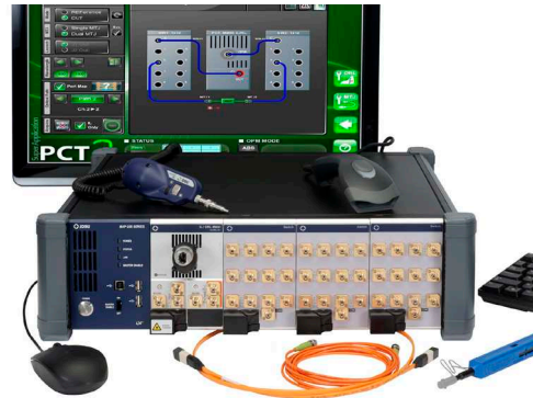
Leverage the power of optical switches to convert the mORL into a fully featured MPO test solution