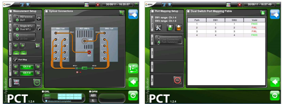
Port mapping (also called continuity or polarity testing) is enabled with two optical switches

Port mapping is an additional software application (mSUP-PCTMAPPING) that unlocks the power of two optical switches inside the PCT framework to let users pre-program connectivity or polarity templates and to quickly verify whether the DUT complies before executing IL or IL/RL tests. Leveraging the speed and unique capabilities of JDSU optical switches, this testing can be accomplished in less than a quarter of the time it takes to fully characterize the assembly. The port-mapping application also has a discover mode that is particularly powerful for breakout cable assemblies. Using the discover mode eliminates the need to pre-select outputs or match DUT outputs to switch outputs. Users can simply connect it as quickly as possible and allow the application to find the ports prior to test. Field trials indicate that this can cut connection times in half. Once the port maps are established, the information seamlessly feeds back into the instrument and test script modes.