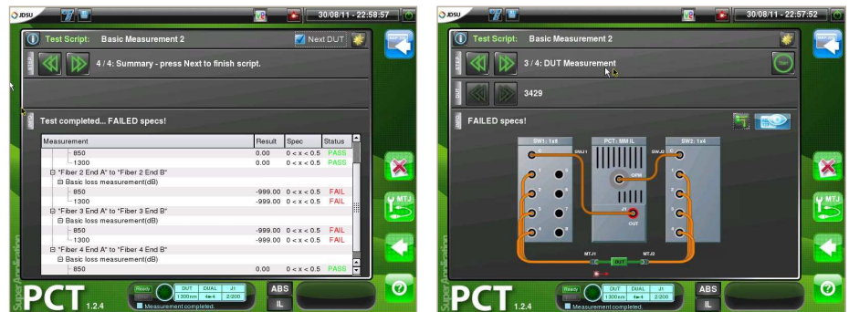
Screen shots from the onboard script mode for production testing

Script mode fully automates tests with user-programmed test sequences and provides an SQL-light database to store results in a password-protected environment. Serial numbers may be generated locally or entered using a USB barcode reader. User-defined scripts ensure that production procedures are followed strictly while a full HTML editor can be used to embed instructions and photos for operators to follow. Users can print reports and labels or export data from the database for analysis. A database query engine lets users extract results based on criteria such as device type, connector type, or customer.