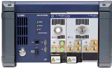
PCT solution with mORL modules that cover all three fiber types