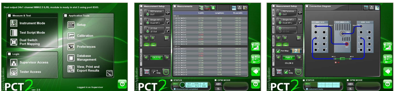
Example screen shots from the PCT application framework. Simple results views and real time connection views simplify use.

Instrument mode lets users quickly and easily access all the key setup parameters in a simple easy-to-use intuitive GUI, which is ideal for R&D and qualification labs. This feature gives users maximum control in a rapidly changing environment. Users have constant access to interactive windows showing current connections and measurement setups. Quick-save features let users save test results to text files and window settings to simplify recall.