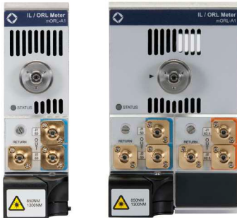
Multimode fiber mORL-A2, 50 µm with mBID Bidirectional options and a dual-fiber version of the module