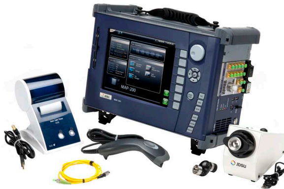
Examples of the range of accessories available for use with the PCT

To simplify workflow, several standard third-party accessories can be used including a standard mouse, keyboard and ASCII text-entry-based barcode readers. The unit directly supports two label printers; see the ordering information for specific models. It also supports network printing on postscript-enabled printers. Contact the JDSU technical assistance center for concerns or questions regarding supported devices.