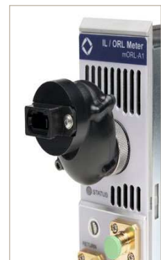
The JDSU AC990 attached to the front panel of an mORL module with an MPO power meter adaptor