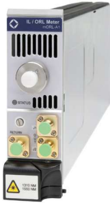
Single-mode fiber mORL-A1 with mBID Bidirectional option