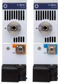
mIL-A2 modules: One for 50 \mu\text{m} fiber (OM3) and another for 62.5 \mu\text{m} fiber (OM1)