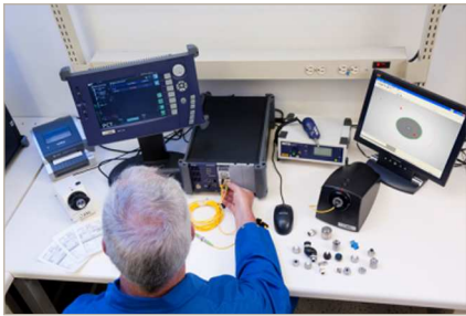
Operator leveraging the IL/ORL test solution alongside connector inspections