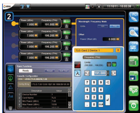
Example of an mTLG screen

The MTLG-C1 is a member of MAP-200 LightDirect basic fiber optic test tool family. LightDirect modules can be deployed in all available MAP chassis systems including the MAP-220C two-slot benchtop chassis. The MAP-220C is ideal for bench use or small test automation projects, and it features a local touch screen as well as Ethernet or GPIB automation. The second slot is ideal for an optical power meter or variable optical attenuators. The MAP-230B (three-slot) or MAP-280 (eight-slot) is ideal for large deployments and is the most compact optical test solution on the market.