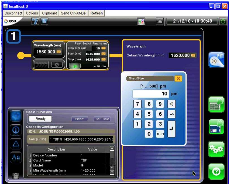
Figure 2. mTBF GUI - detailed view

The filter makes use of a diffraction grating to separate the input light along several discrete paths. A stepper-motor rotates the grating to transmit the desired wavelength along the output fiber.