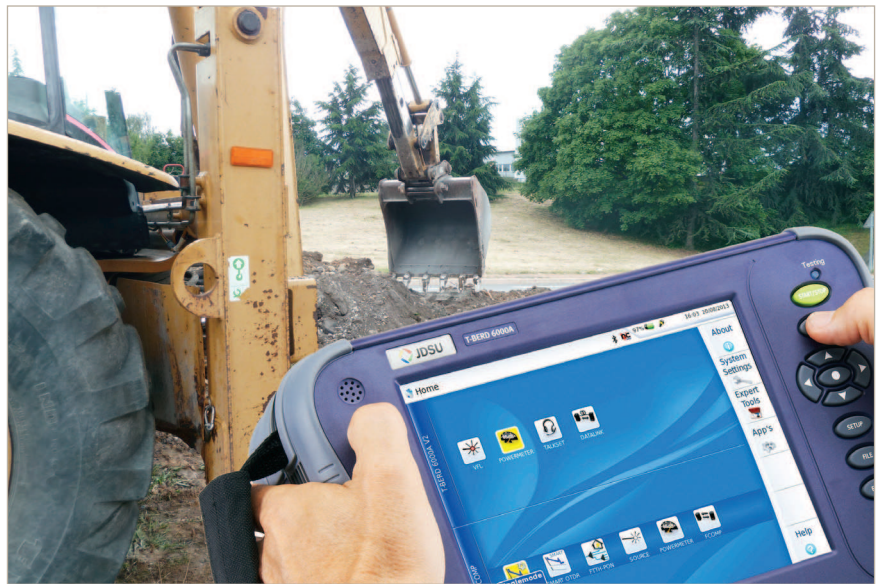
Portable and upgradeable platform with interchangeable test modules increases technician productivity

The flexibility of interchangeable module carriers and various plug-in modules let users create a platform that meets today's specific testing needs and yet it can evolve seamlessly to meet tomorrow's ever-changing network requirements.