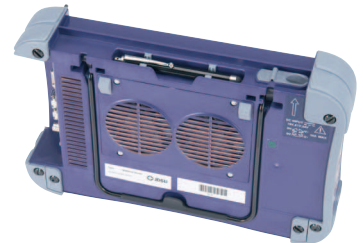
E6200 MSAM and Fiber module carrier