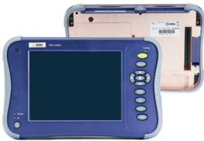
Back of the module carrier where other modules are attached

The multidimensional design of the T-BERD/MTS-6000A (V2) provides optimal configuration flexibility with extended battery life. The E6100 module carrier is best suited for fiber applications; whereas, the high-powered battery in the E6200 module carrier extends battery life when used with the carrier Ethernet (MSAM) or other intensive fiber applications.