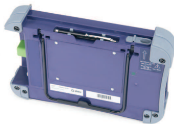
E6100 Fiber module carrier