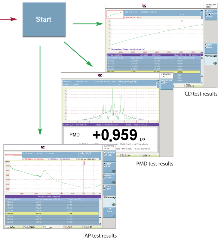
CD test results