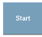
2. Press Start