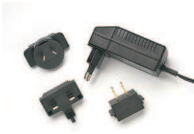
Worldwide compatible AC adapter/charger (SNT-121A)