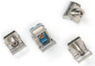
Optical adapters (BN 2150) for laser source output