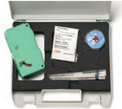
OCK-10 Optical connector cleaning kit (accessory)