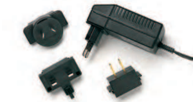
Worldwide-compatible AC adapter (SNT-121A)

Three lasers with built-in optical isolators are combined to the angled physical contact (APC) optical output, providing easy return loss measurements without the need of external normalization. High-precision fiber couplers and an auto-zeroing function (patent pending) guarantee outstanding measurement accuracy.