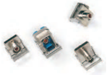
Optical adapters (BN 2150) for laser source output