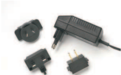
Worldwide compatible AC adapter/charger (SNT-121A)

on the fiber, 1490 and 1550 nm downstream and 1310 nm upstream. The 1310 nm channel provides correct power measurements of burst type upstream PON signals.