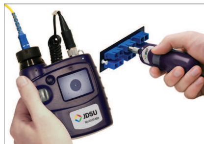
FBE Probe with HD3-P Display