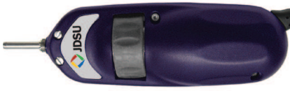
FBE Probe Microscope