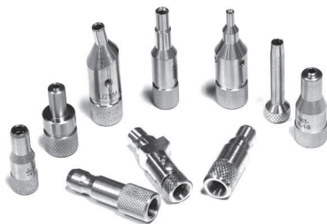
Wide selection of inspection tips and adapters for mainstream connectors and applications

Contamination is the number 1 reason for troubleshooting optical networks. Proactive inspection and cleaning of fiber connectors can prevent poor signal performance, equipment damage, and network downtime.