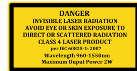
Output power and laser emission indicator label