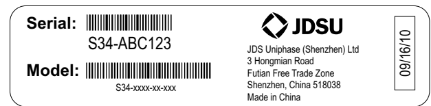
Shipping box label