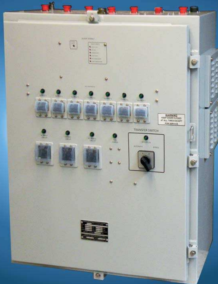
OPTIONAL FEATURES SHOWN