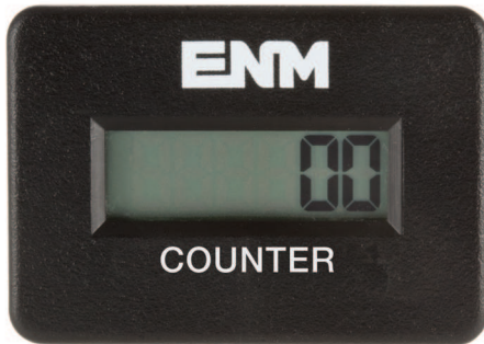
C44F65C 4.5-60 VDC/VAC 50/60 Hz C44F69C 115-275 VDC/VAC 50/60 Hz

ENM's series C44 Counter features a 6-digit, 7 segment LCD display. The accumulated counts are stored on powerless, non-volatile data backup using CMOS EEPROM technology, where small space and reliable instruments are required with memory that does not rely on a battery.