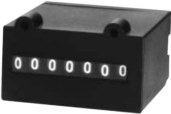
7-Digit Series E14B Frog Eye

ENM's new series E14B Electronic Impulse Counters are designed for use on PC Boards, control panels and other applications requiring a high degree of accuracy and reliability with very low power consumption and long life and high counting speed in minimum space. Units have high impact plastic cases, are insulated, and require no lubrication. Available in AC and DC models.