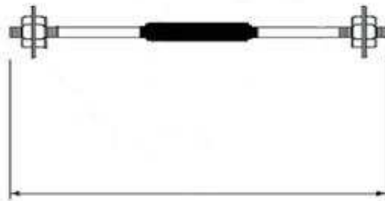
5/16" Diameter by 8" Long Sensor

Because of their low profile design, these sensors can be used in concrete pavements, columns, walls, bridge elements or wherever dynamic strains need to be measured.