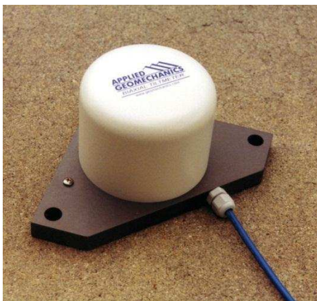
Model 711-2 (4X) Weatherproof Platform Tiltmeter

Each tiltmeter comes with a hookup cable and power supply for quick operation using your PC.