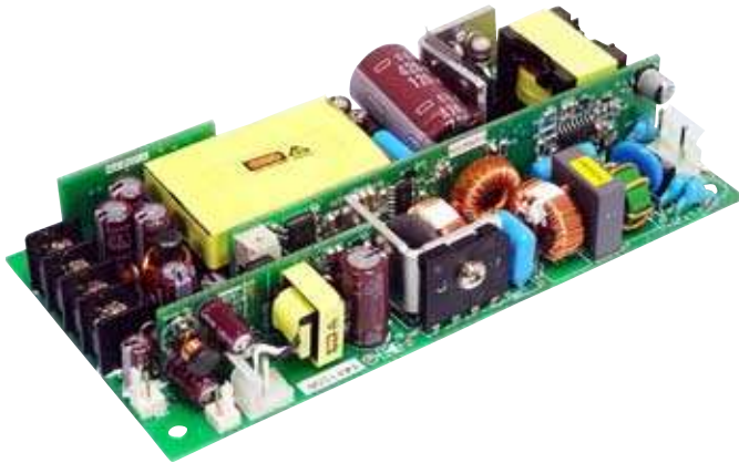
3.6" x 6.6" x 1.35"