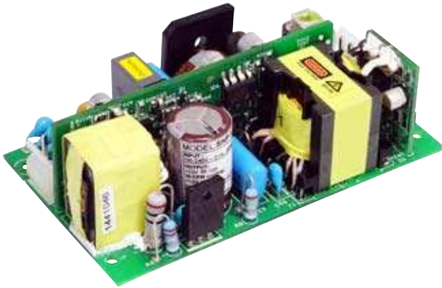
2.39" x 4" x 1.28"