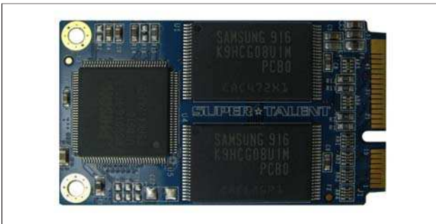
Half Mini 2 PCIe SSD

The Half Mini 2 PCIe SSD is an upgrade module specifically designed to be a drop in replacement for the Dell Inspiron Mini 9 netbook PC. The modules are available with both MLC and SLC Flash memory. The modules are simple and easy to install for immediate capacity and performance benefits.