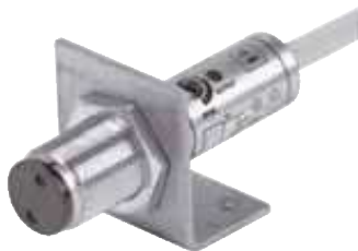
Sensor fitted inside the mounting aid

Using the mounting aid cylindrical sensors are fast and easy to fit. Use the nuts included with the sensor for attachment.