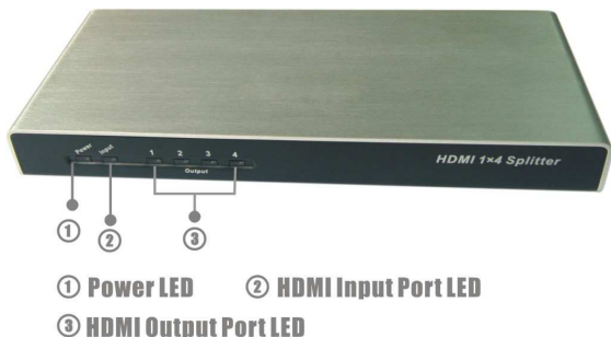
Figure 1. Front Panel Layout