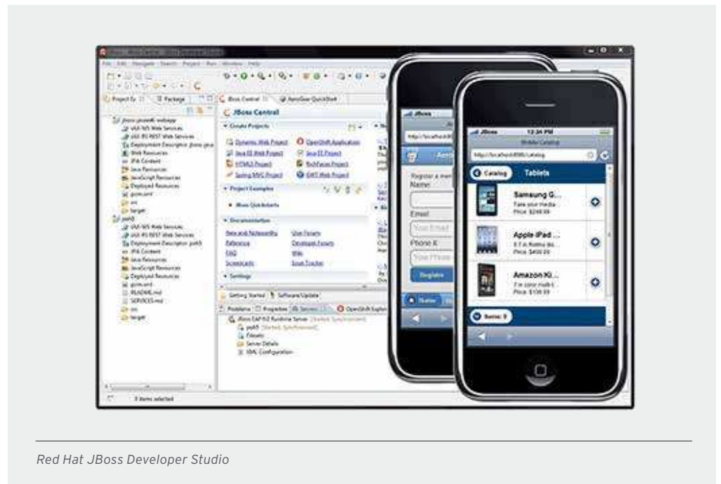
Red Hat JBoss Developer Studio

Developers can have confidence that their development environment is stable, upgradeable, deployable, and supportable.