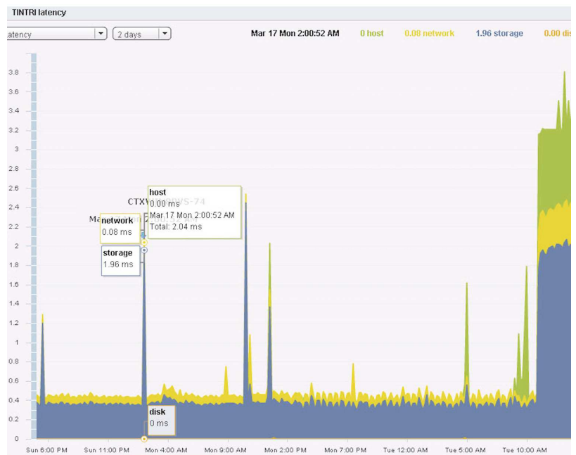
End-to-end latency shown over a two-day period including separate information on disk (shown in orange; not visible), storage (shown in blue), network (shown in yellow) and host (shown in green) latency.

Retention policies can be customized at a VM-level for local and remote snapshots. Clone VMs are replicated and stored highly efficiently as the common snapshot on remote VMstore is used to re-create clone VMs, which results in no data being sent over the WAN and no additional storage space consumed on the remote VMstore for storing the replicated copies.