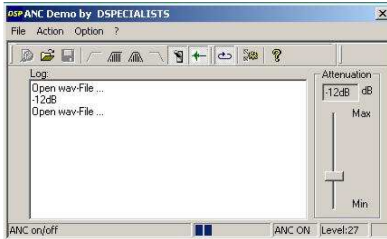
Dialog box of stand alone ANC demo for PC

The PC demo can be used to process own sample files in wave format. The PC algorithm is identical to the DSP version and thus allows it to evaluate the ANC performance in a very easy and convenient way. Besides the attenuation factor different input filters for band limitation can be applied.