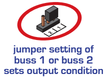
each output is programmable for constant voltage or fire alarm drop at either 12 or 24VDC