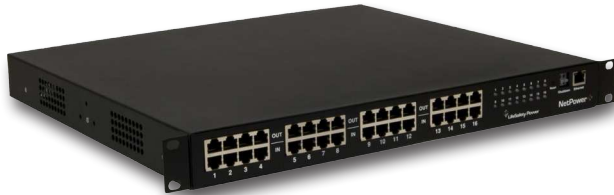
U.S. Patent 8,566,651 other patents pending