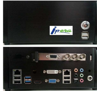
Pixel Xstream L2xxx Appliance

The Pixel Xstream Appliance is a multi-format HD and SD streaming media encoder and transcoder running Ipera's Pixel Xstream® software with the ability to ingest and stream live video or IP sources. It can transcode and stream in real-time, save to a file, or both. It is ideally suited to meet the challenges of ingesting, repurposing and monetizing content for a variety of web, mobile, IPTV and broadcast applications.